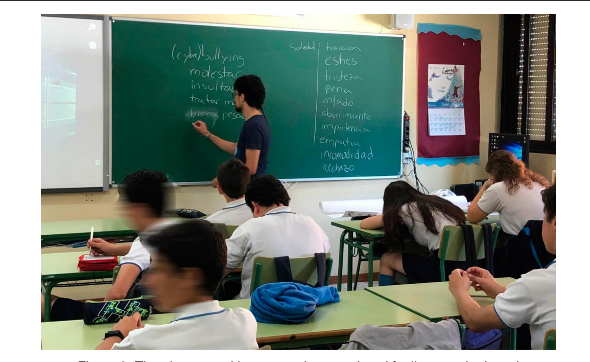
Figure 3. The observer taking notes about students' feelings on the board.

On the other hand, among the things that caught their attention the most are the way that the protagonist was treated, the nightmares that appear in the game, how the bully starts bullying because of a confusion on seating assignments with the bully on the first day of the game, how friends stop defending you in the middle of the game, not being able to defend yourself, and not being able to ask for help until the end of the game.