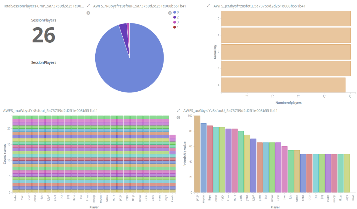
Fig. 2. Sample dashboard to show information for teachers while games are in play.

A further step to simplify educators' task when applying games in schools is to ensure that they do not lose control of their students' progress while they are playing. An easy way to give educators information about what students are doing in their gameplays is with some type of visual analytics that aggregates all the game learning analytics data coming from each student's gameplay interactions. This visual information