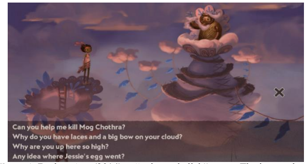
Figure 1. Broken Age (2014), a "point and click" game. The image shows two characters having a conversation and the conversation options given.

In adventure games, the player is placed inside of this narrative context, and must interact with the environment (scenarios) and the characters or items it contains, occasionally solving mini-game puzzles. These features are especially useful in educational games, as players need to