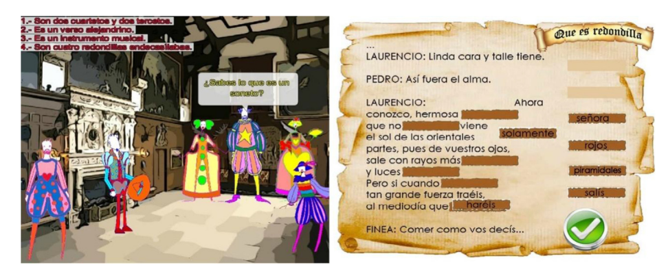
Fig. 2. Final stage in the game (left). Snapshot of a puzzle in the game (right).

Internal consistency of the scale used for student interest in theatre play (I) was measured through Cronbach's Alpha test, resulting in .785 for I in the pre-test, .850 in the post-test. Cronbach's Alpha test could not be used in the other instruments because of their nature.