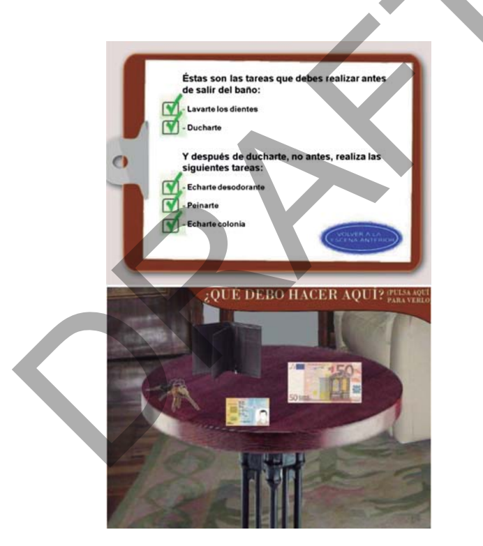
Fig. 1. Screenshots of the game "The Big Party".

The Big Party [12] is an eAdventure game (Fig. 1) that aims to teach persons with different levels of cognitive disabilities life management skills related to personal hygiene, safety, social interaction and transportation. The goal of the game is to reach a party organized by the player's company for all the staff. To complete the game, players must find their way through different common situations of daily life until they reach the venue of the party. This game was played by 19 players of different ages and with different levels of cognitive disabilities.