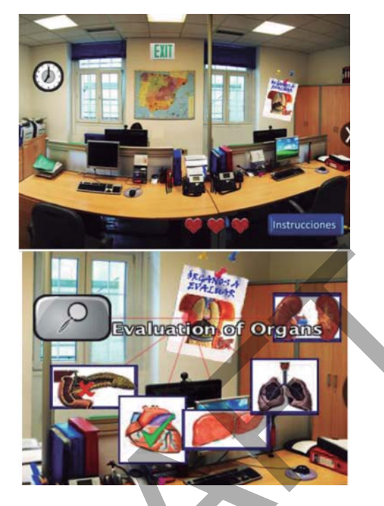
Fig. 4. Screenshots of the game Donations. Main central office of the ONT and action of organ evaluation.

is administered just before students start playing and a post-test administered after the intervention, but it can be used more times for longer or longitudinal experiments. The results of different measures of the questionnaires are compared (e.g. pre-test Vs post-test) to determine the effect of the game.