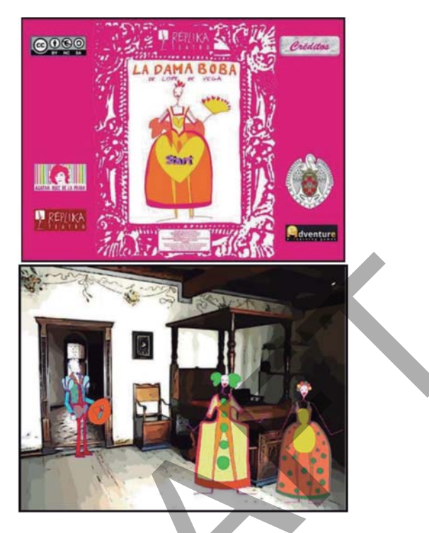
Fig. 3. Screenshots of the game La Dama Boba. Character design inspired in customs by Agatha Ruiz de la Prada for an adapted version of the play.