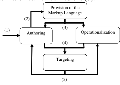
Fig 2. Sequencing of the activities

The activities introduced in the previous subsection are sequenced as depicted in Fig 2. As suggested in this scheme, the process is author-driven. It starts with the authoring activity (1), where the source contents (main document and related resources) are provided. In order to structure these contents, a suitable markup language is provided during the provision of the markup language activity (2). Next, the contents are structured accordingly at an additional authoring step, and suitable translation software is also provided at an operationalization step (3). Finally, source contents are transformed into target ones by processing them with the translation software during targeting (4). If the result is not satisfactory, further authoring and/or operationalization can be carried out (5).